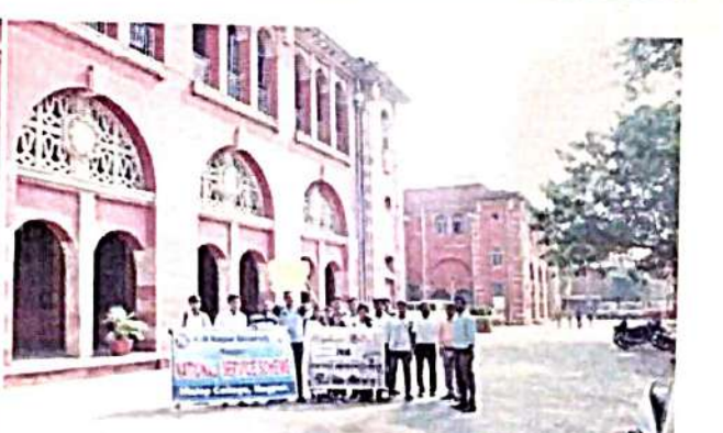
Glimpses of the rally organized by the NSS Hislop Unit