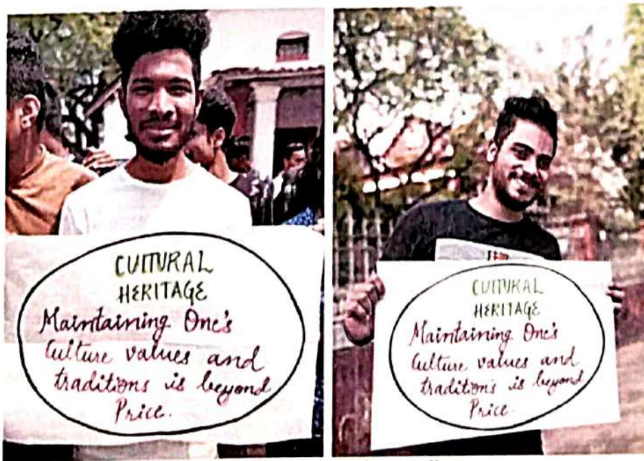
Glimpses of the Heritage rally