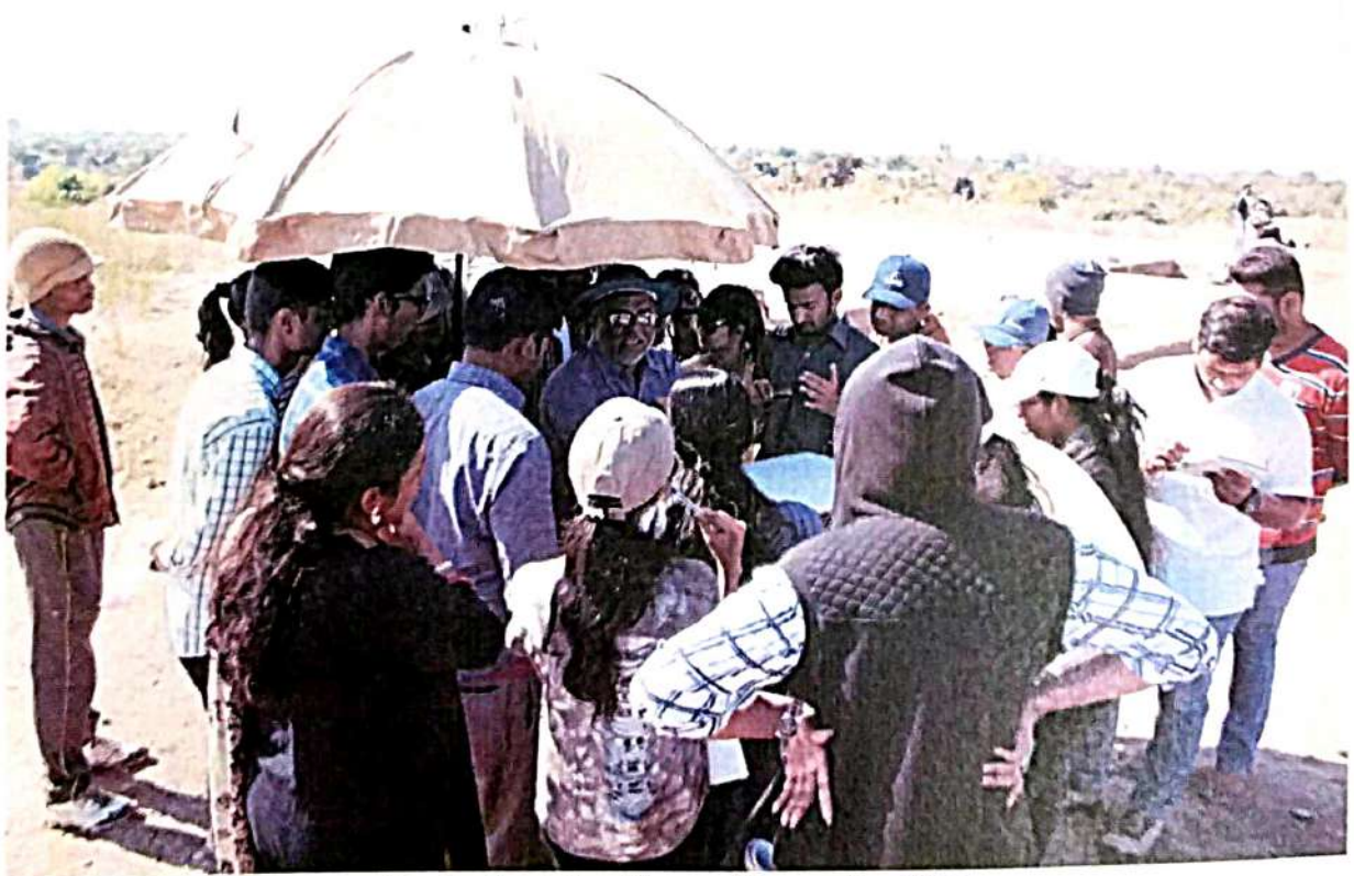
Students at the Khapa, Excavation Site

Certificate Course in 'Heritage and Culture Studies' 9 th January - 25 th January, 2018