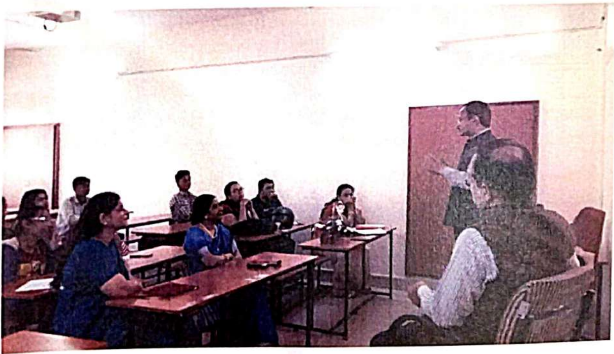
Certificate Course in 'Heritage and Culture Studies' 9 th January - 25 th January, 2018