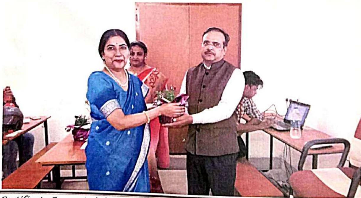
Certificate Course in 'Heritage and Culture Studies' 9 th January - 25 th January, 2018