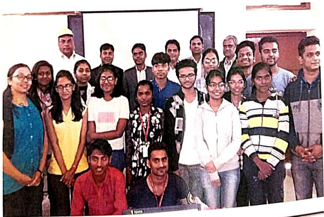
Certificate Course in 'Heritage and Culture Studies' 9 th January - 25 th January, 2018