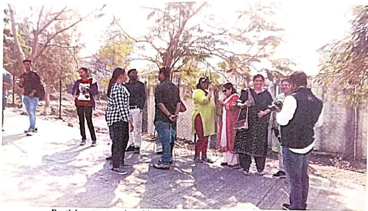
Participants at various historical sites in and around Wardha city